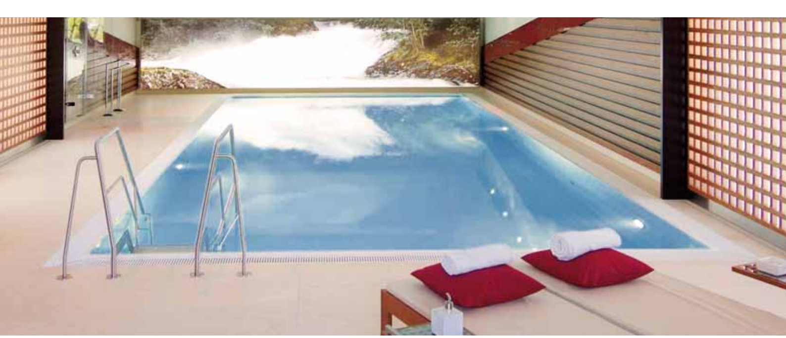
A new generation of swimming pools